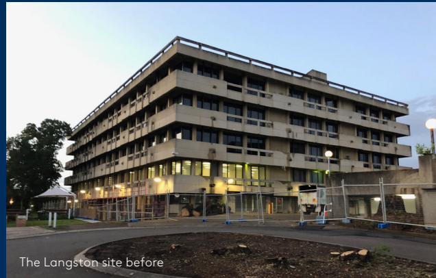
The Langston site before

With completion currently targeted for Q3 2021, The Langston is well on the way to becoming the centrepiece of the future Epping Town Centre.