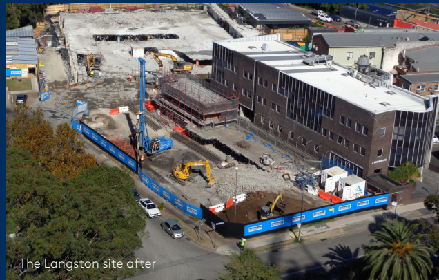
The Langston site after